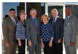
Representatives from The George Foundation

After unofficially starting its first ever Capital Campaign in late 2007, the CORPS has officially closed on its new home in Missouri City. The 7,800 square foot office/warehouse space located at 13330 South Gessner Road between Highway 90A and the Beltway will be the new home to the Fort Bend CORPS. The new building will provide for ample office and warehouse space. The building has been designed for any future office expansion the organization may need.