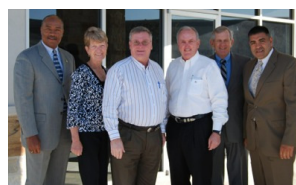
Representatives from The Sprint Companies