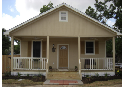
3 bedroom-910 square foot cottage built to "green standards"

The Fort Bend CORPS and Dulles High School PALS officially handed over the keys to Obdulia Estrada & family at a dedication ceremony held on May 23, 2010. Several family, friends, co-workers and PALS were on hand for the dedication. The 910 square foot, 3- bedroom, 1- bath cottage home built to "green standards" was debuted to the awaiting audience who chanted "Move That School Bus", where the beautiful cottage home was awaiting the family.